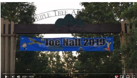
Joe Nall Sights & Sounds