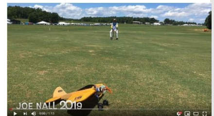
The Rusty Flying Chair