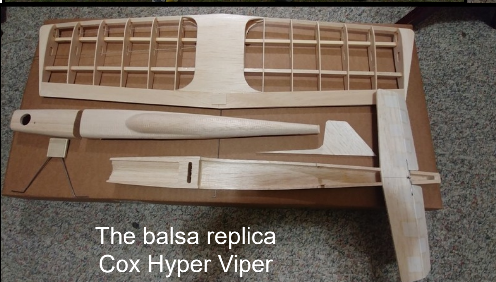
The balsa replica Cox Hyper Viper

https://stunthanger.com/smf/southridge-cnc/hyper-viper/