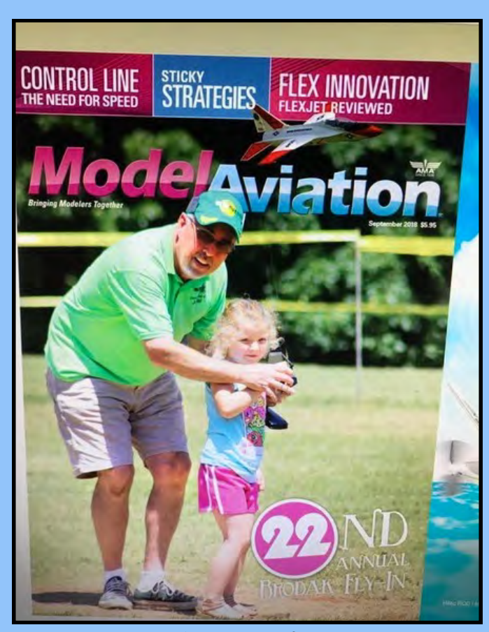
That's all folks! See you in October

Contains current and past issues with printer friendly calendar and articles