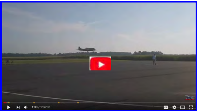
Top 5 Flyoff