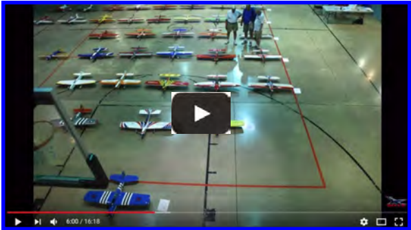
NATS Sights and Sounds