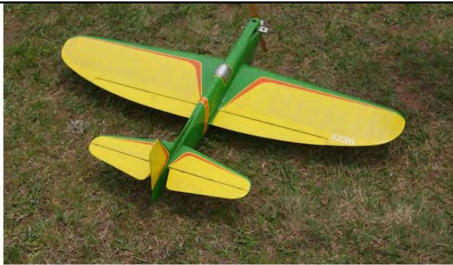
Derek Barry flew in Classic and Expert PA with the Thunderbird / Fox 35