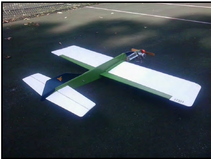
Brodak Pathfinder Mark-II