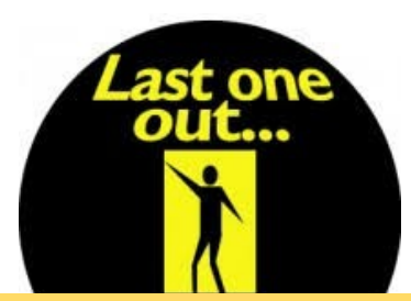
Last one out Please...