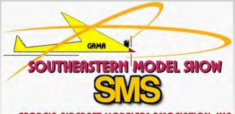
GEORGIA AIRCRAFT MODELERS ASSOCIATION, INC.

Southeastern Model Show in Perry Ga. on March 4th & 5th is the largest model swap meet in the east that I know of. It starts on Friday and ends Saturday afternoon, just in time to drive back to Raleigh. Plans have changed a little, we have made reservations across the road from the fair grounds and will be making the 7 hr. drive on Thursday afternoon. Right now we can carry 1 more so If you want to go and need a ride please contact me at <u>rdrcnews@gmail.com</u>.