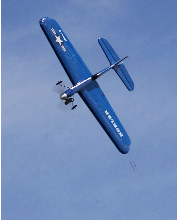
The Nobler was flying along just nice: