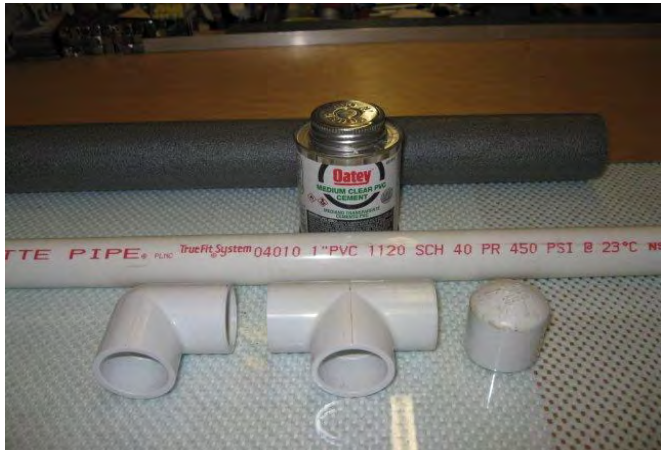
I obtained all of these supplies from Home Depot

This rack loaded with the five models can be placed against a wall, or you can slide it across the floor easily enough to move it out of the way.