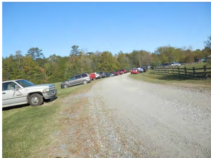
Parking looking from the gate house