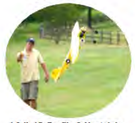
I & II, 15, Profile & Nostalgia