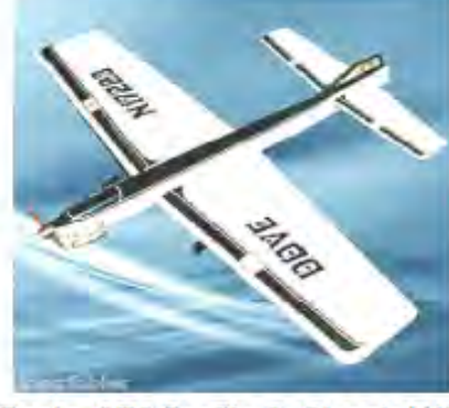
Basic, OTS Profile & Classic/ N30 PAMPA: Beg, Int, Adv & Ex