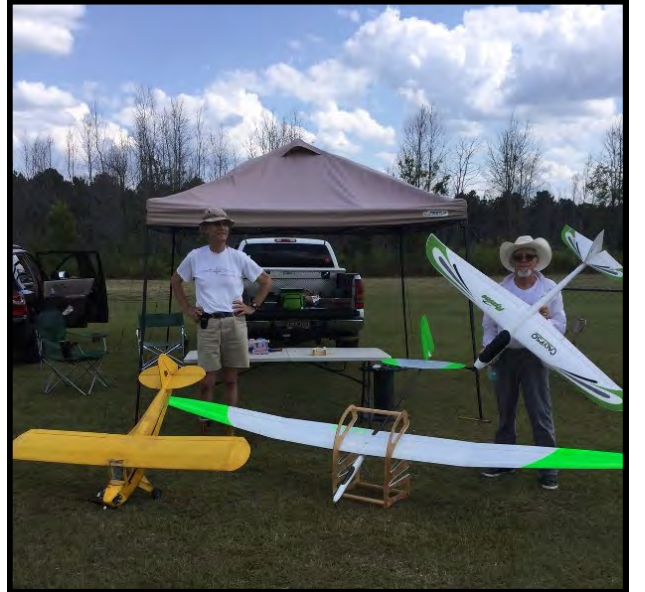
Some more of our new friends at Congaree With their strange flying machines