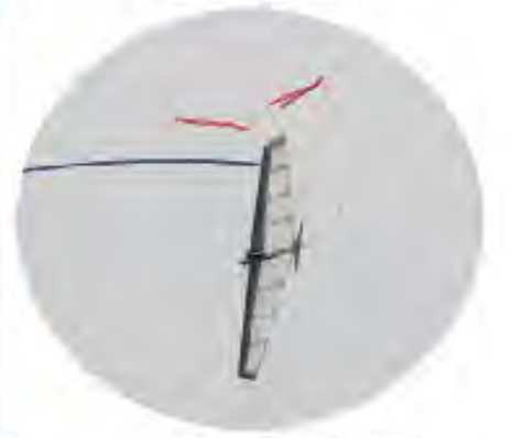
1/2A & Speed Limit

Waymer Flying Field 15401 Holbrooks Road Huntersville, NC 28078