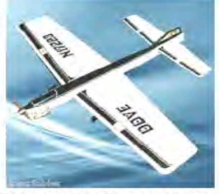
Basic, OTS Profile & Classic/ N30 PAMPA: Beg, Int, Adv & Ex