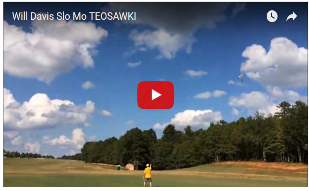
Thanks for reading.

So we flew all day long, from 11:00 till after 4:00 and got a whole lotta flights in. The wind was light on the ground, but up high it was unpredictable, coming through the trees. I'd swear a few times if I didn't know better, that I'd hit a bird. Or a rabbit. Or some kinda UFO. As usual, I did some good things, and others were just the same ol' Rusty.