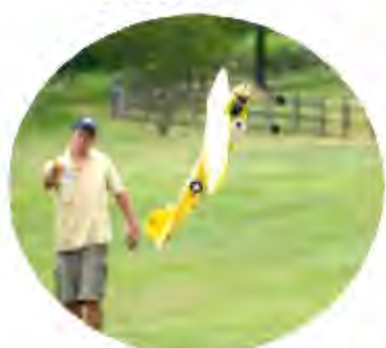
1 & II, 15, Profile & Nostalgia