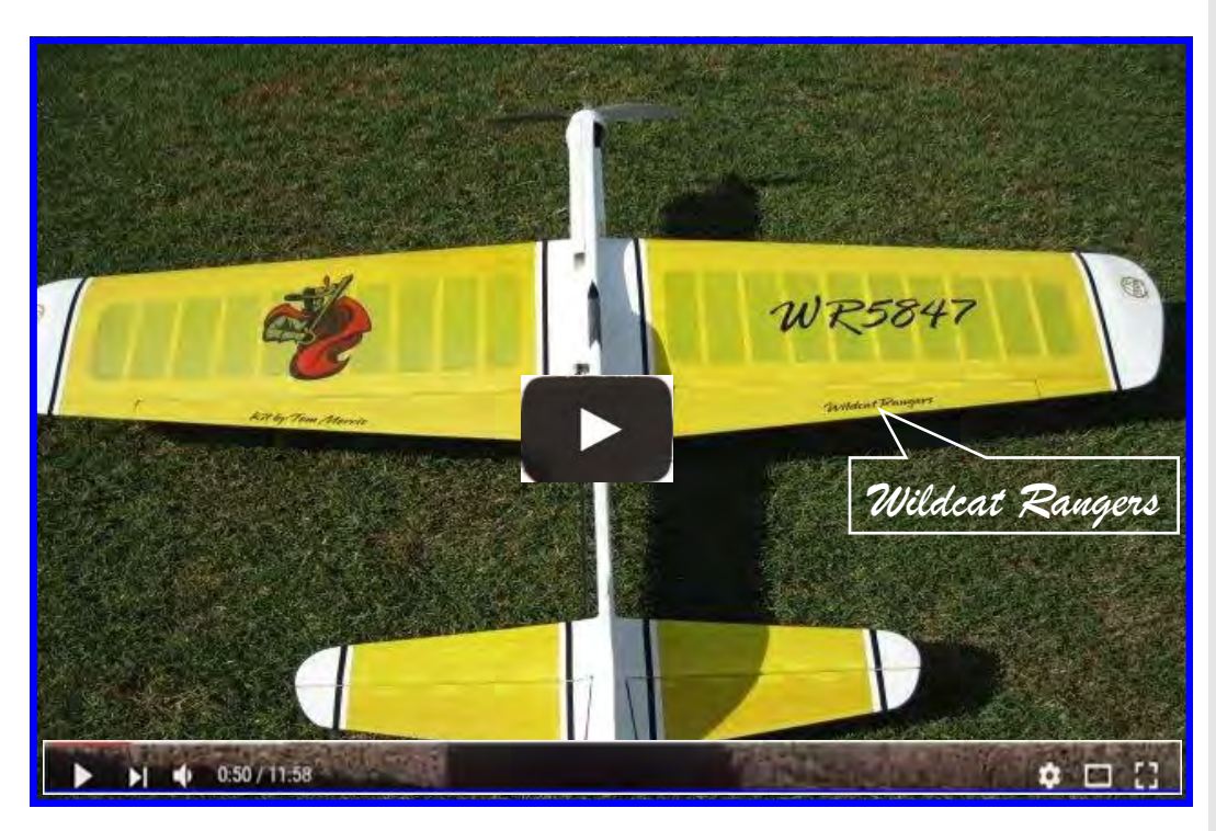
That's it for the Wildcat Rangers' September report. We better get the cameras busy so we have some more to show for next time. All secure at the Wildcat LZ, over and out.

And there is reportedly a recent video of my Twister flying, but it hasn't made it to the 'Tube yet.