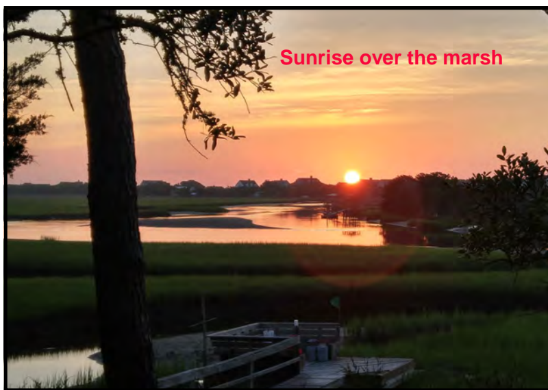
Sunrise over the marsh