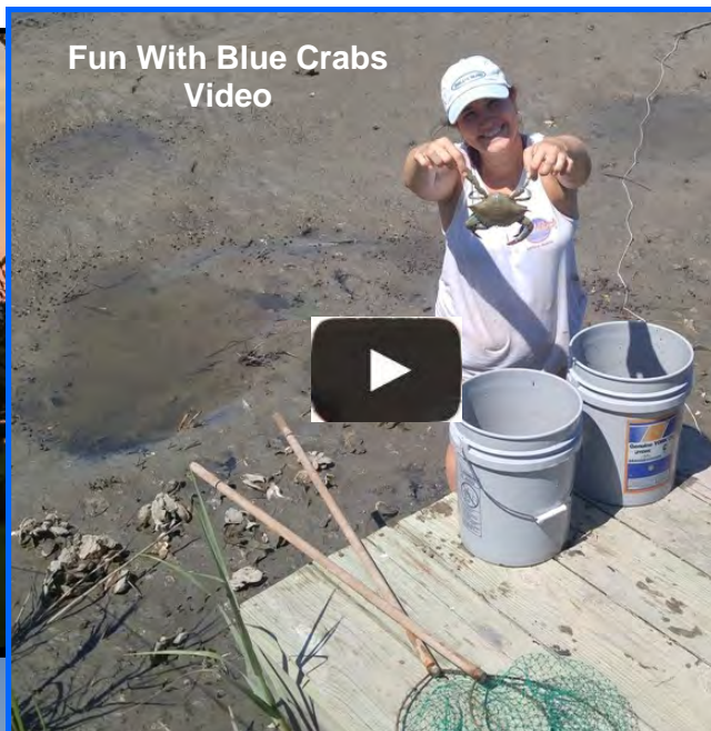
Fun With Blue Crabs Video