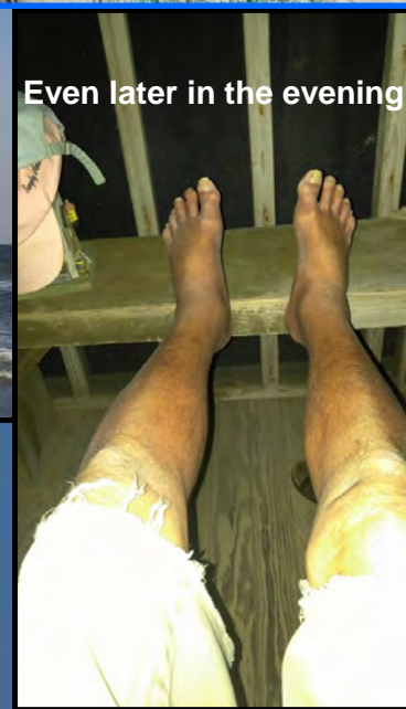
Even later in the evening