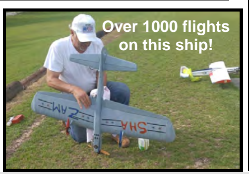
Here's a funny little flick that shows just how loved and respected we Wildcat Rangers are by the R/C Jackson Flyers Association