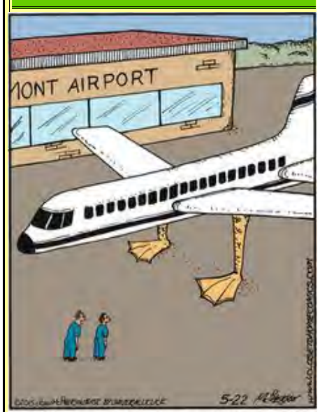
"It's a new safety measure in the event that the plane needs to make an emergency water landing."