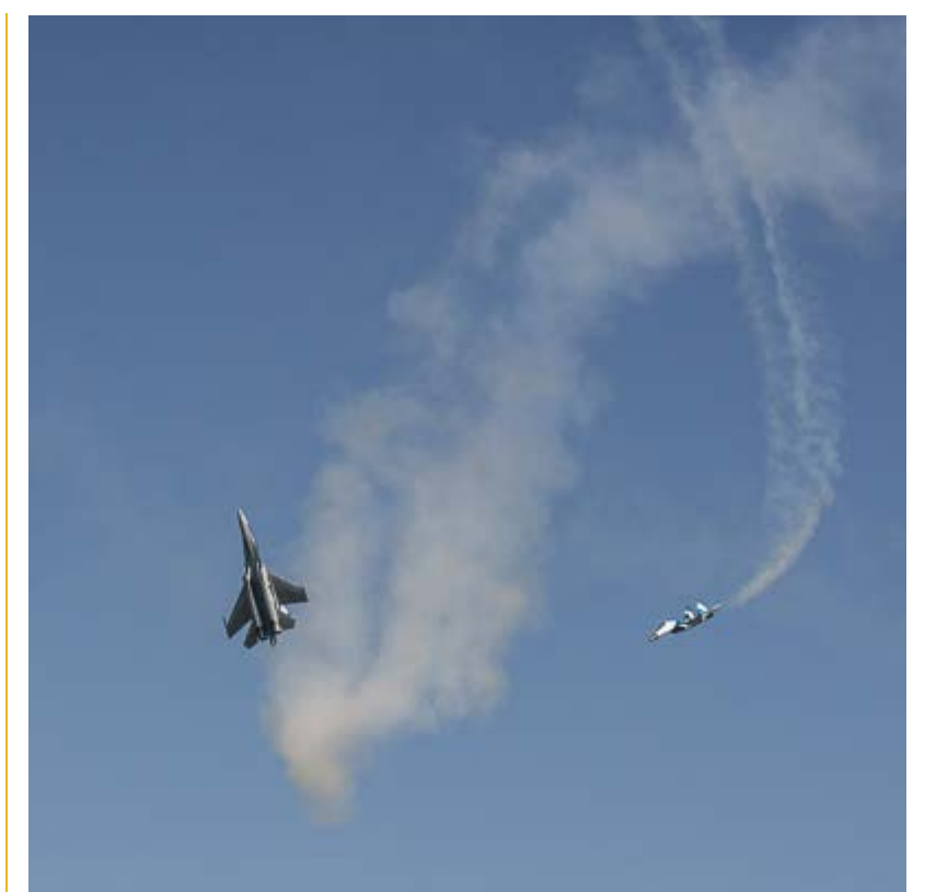
lunch demo hovering turbine