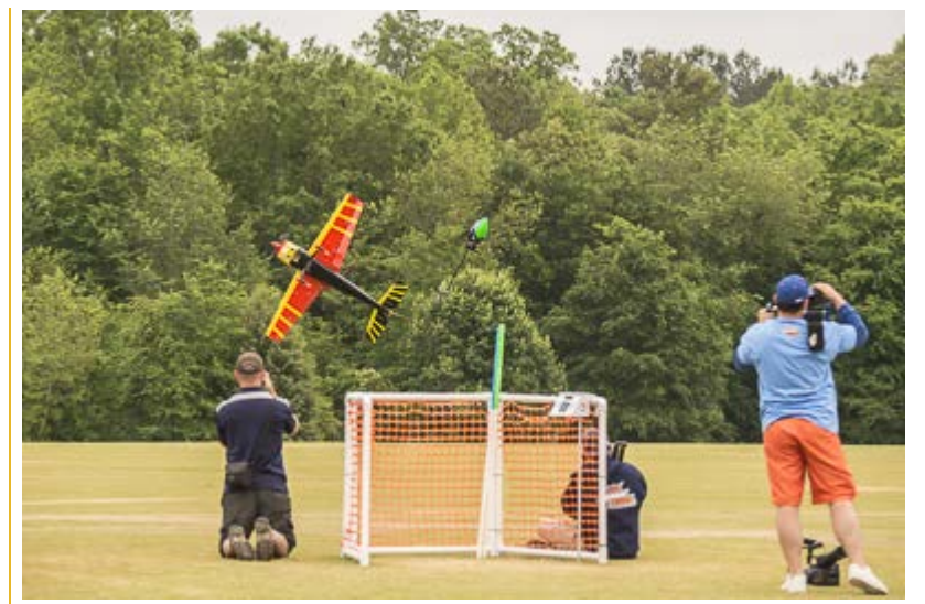
lunch demo 3d