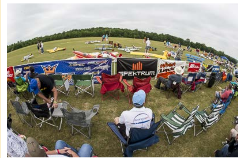
spectators at the flightline