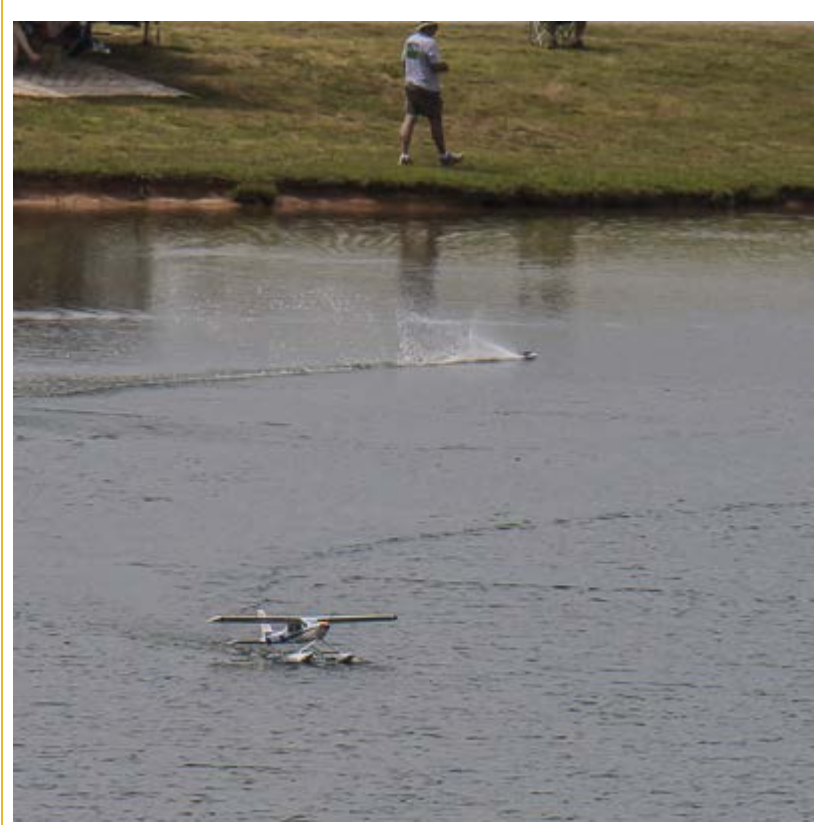
Float fly area