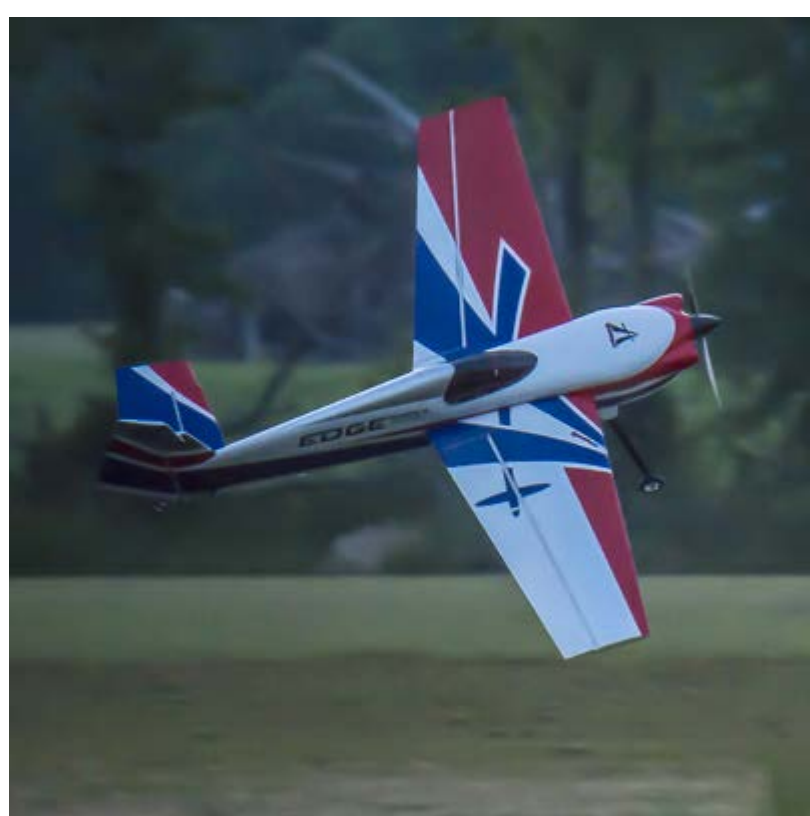
Flying without full horizontal stab