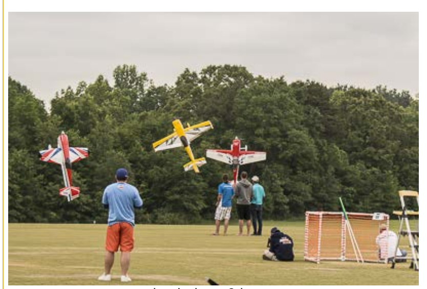
lunch demo 3 hover