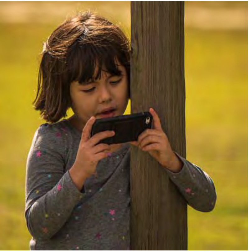
checking social media