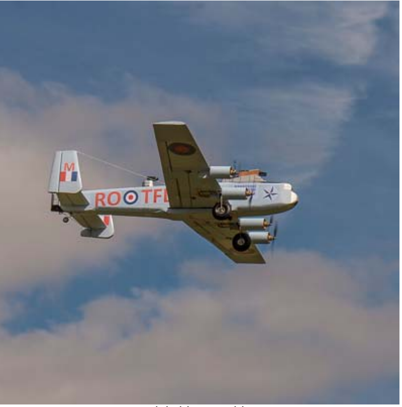
aerial video machine