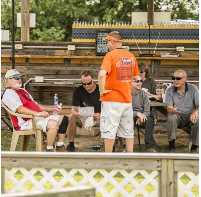
spectators & pilots