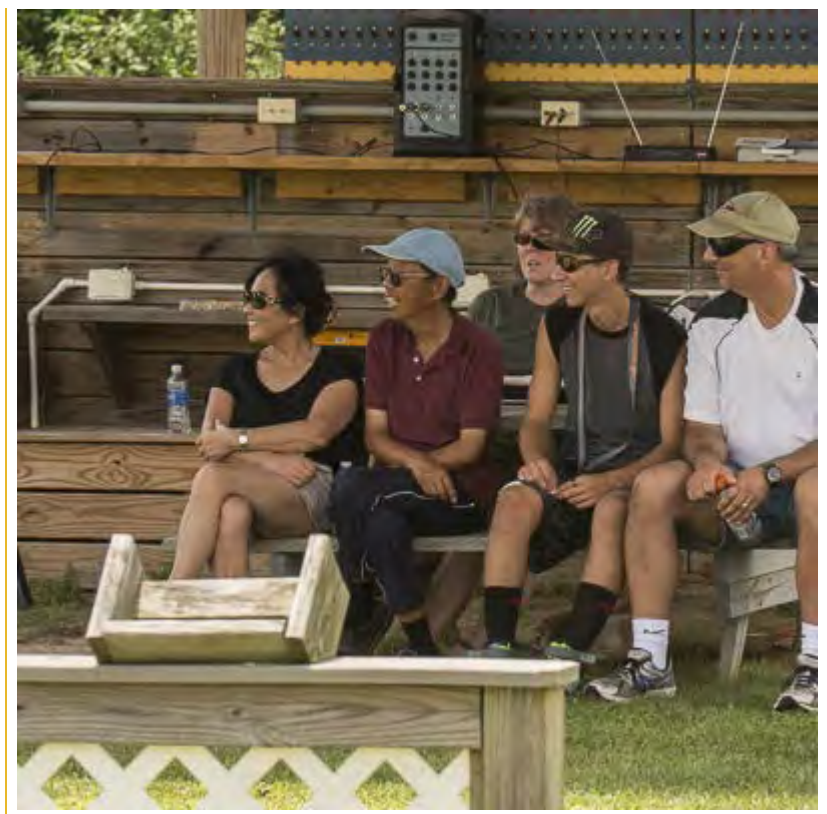
some new faces