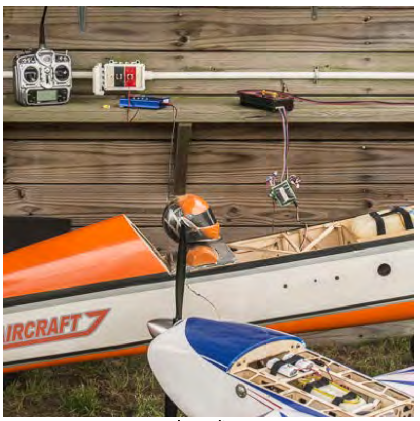
charge it up