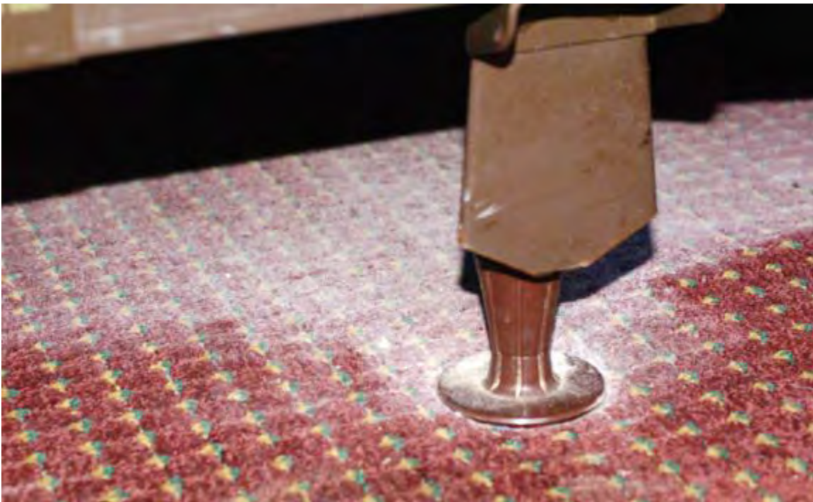
The concept of vacuuming under the bed had eluded the cleaning staff.

Where to stay in Muncie? Somebody please make a suggestion. The AMA site is great for the Nats but as far as Muncie goes (and this Days Inn), it might best be viewed in the rear view mirror as you head down I-69 to the airport.