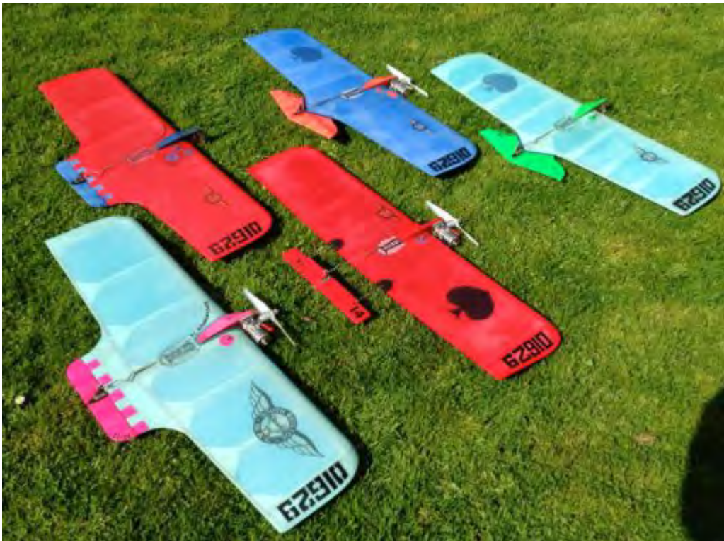
British Vintage F2d models