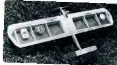
Samurai was a balsa model with a long tail.