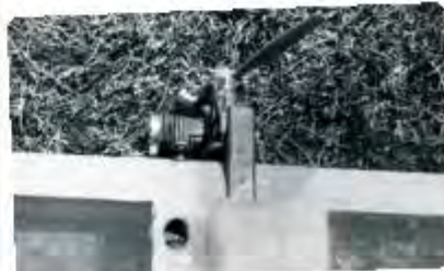
Note the exhaust pipe mount. You might think it burned the wing but it worked which allowed rear exhaust port engines to be used.