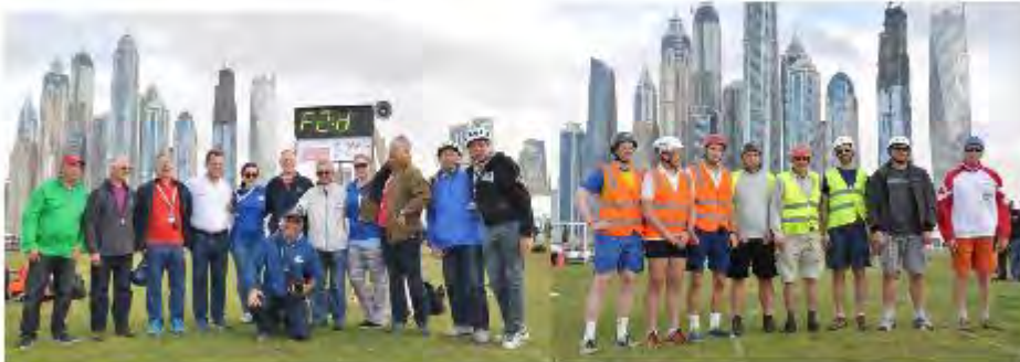
All the Officials; FAI Jury, F2D Judges and Scorers.