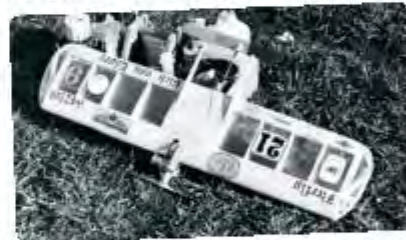
Firefly had a look similar to European models at the time.