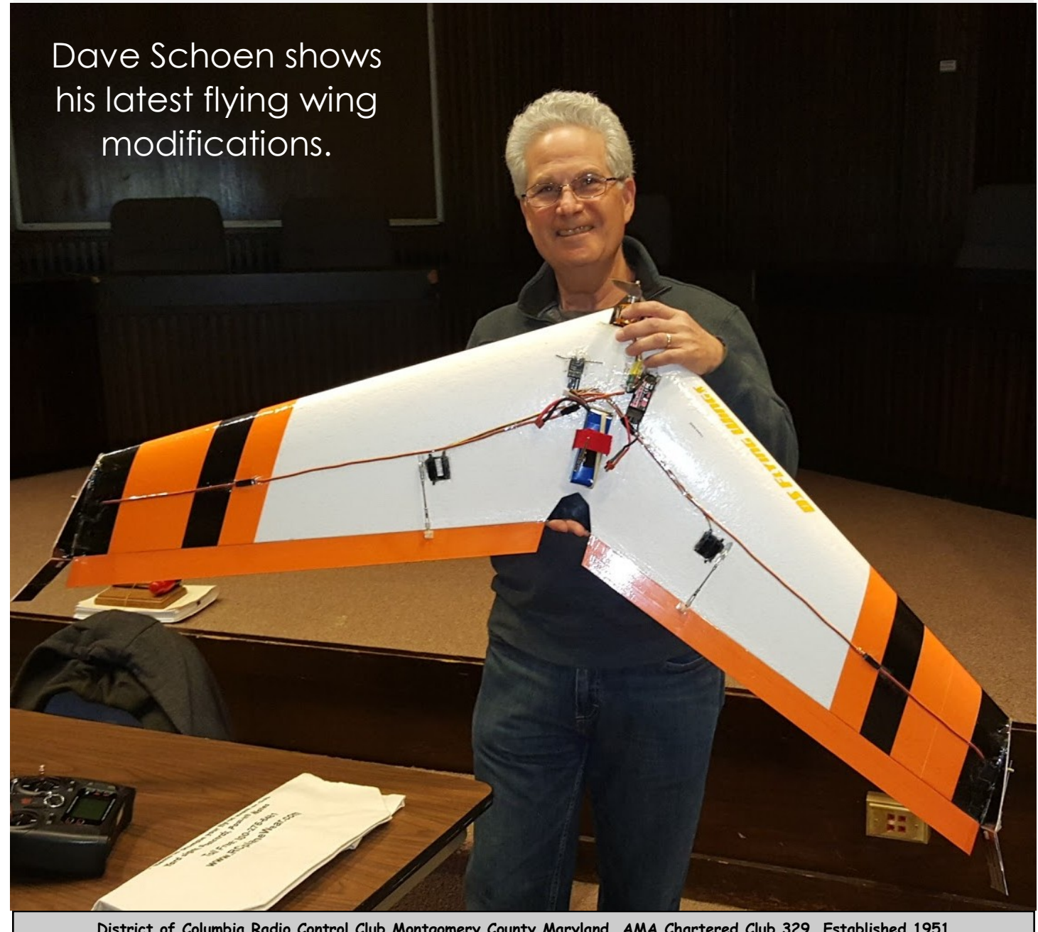
District of Columbia Radio Control Club Montgomery County Maryland AMA Chartered Club 329 Established 1951